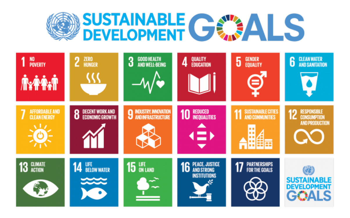
Figure 1. The seventeen UN Sustainable Development Goals

AIMS (African Institute of Mathematical Sciences)-based "Quantum Leap Africa" initiative. AIMS is an institute that is responsible for the promotion of mathematical sciences in Africa. through its "Quantum Leap Africa" initiative, AIMS intends to promote data analytics, machine intelligence, smart systems, and quantum technology in Africa<sup>1</sup>.